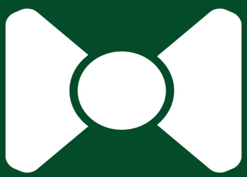
Pr. Santa Ono

Student use of Burnet Woods benefits business, but is not viewed as a necessity No observations of student activities, or what would draw students to the park