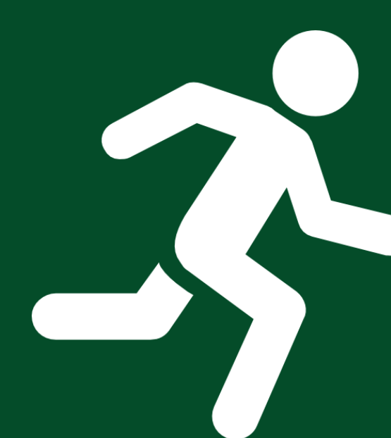
UC Campus Rec Center

Located relatively close to park (Reading & Taft), but has no opinions about students as Burnet Woods stakeholders